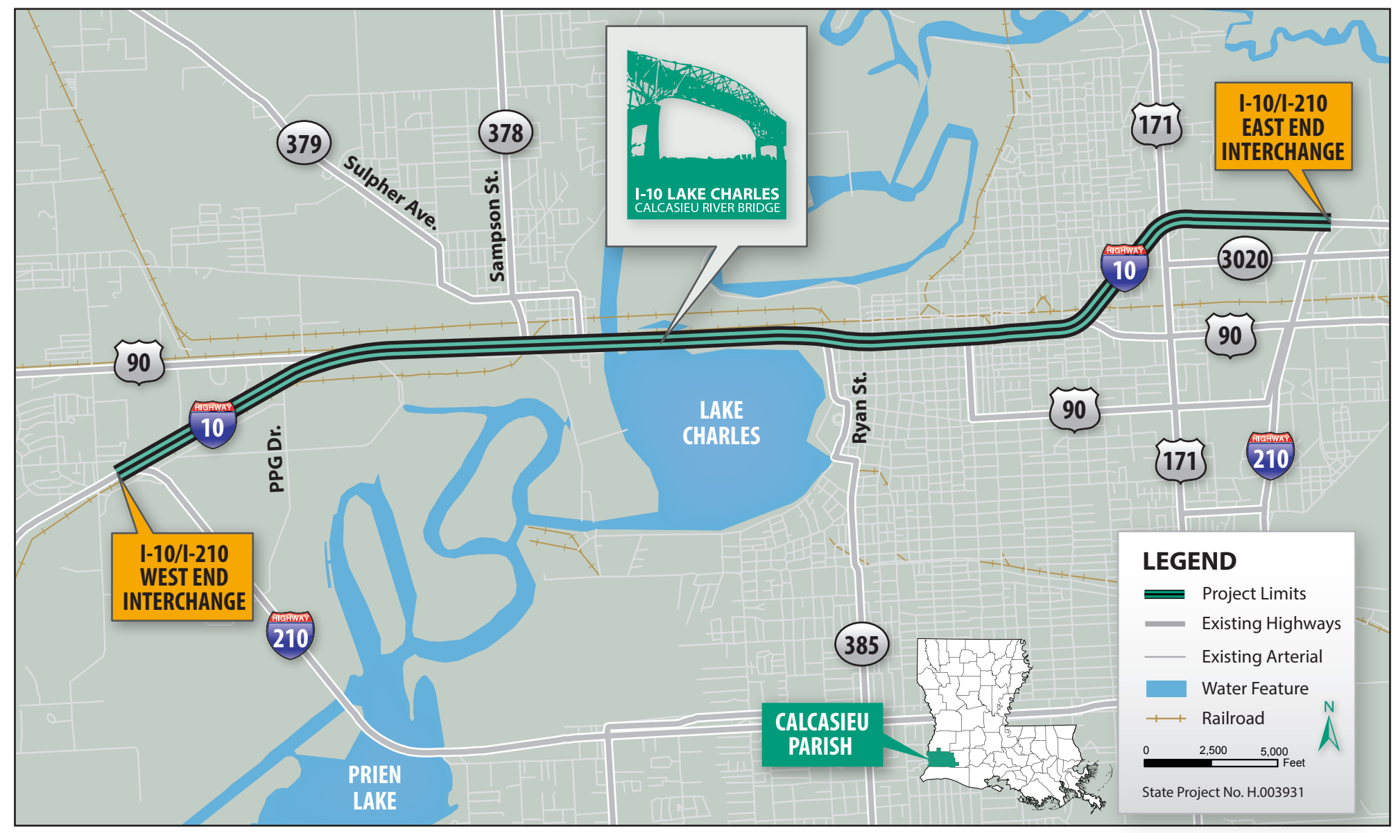
Attachment B-1, Page 3